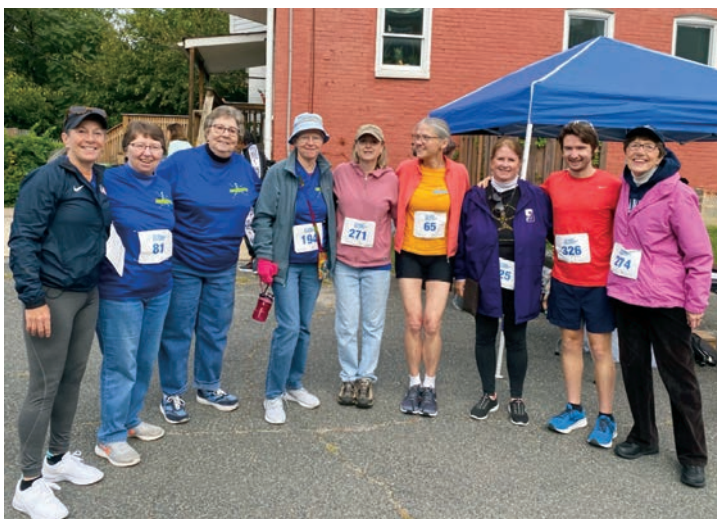
Sisters, SSND staff, and friends of SSND take part in the Marian House 5K.