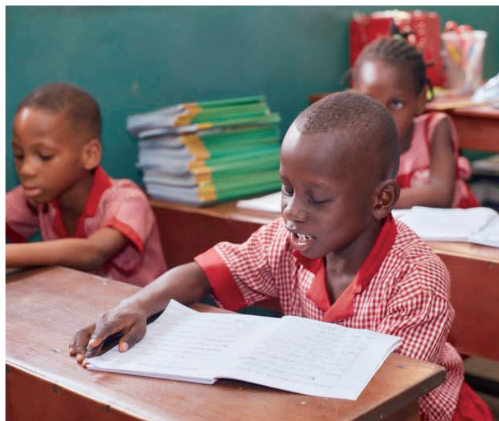
Hillside International School is known for upholding high academic standards.