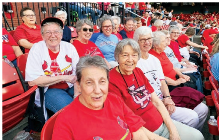
Sisters in St. Louis enjoy a Cardinals-Brewers baseball game courtesy of the Serra Club of St. Louis.