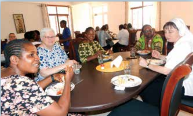
Sisters enjoy the new provincial house in Accra, Ghana.