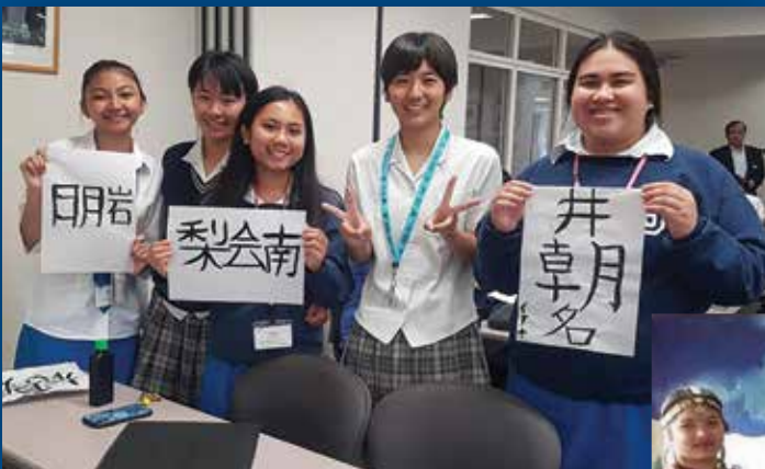
Students from Notre Dame High School in Guam participate in Kakehashi "bridge" activities in Japan. The goal was to build bridges between Guamanian culture and the Japanese culture.

Notre Dame Elementary School in Kyoto, Japan , founded in 1954. The school nurtures each student's potential, and teaches students to have a global perspective and compassion for the poor.