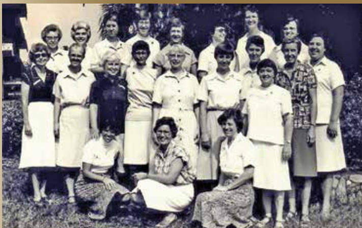
First assembly of SSND missionaries in Nsawam, Ghana in 1981.