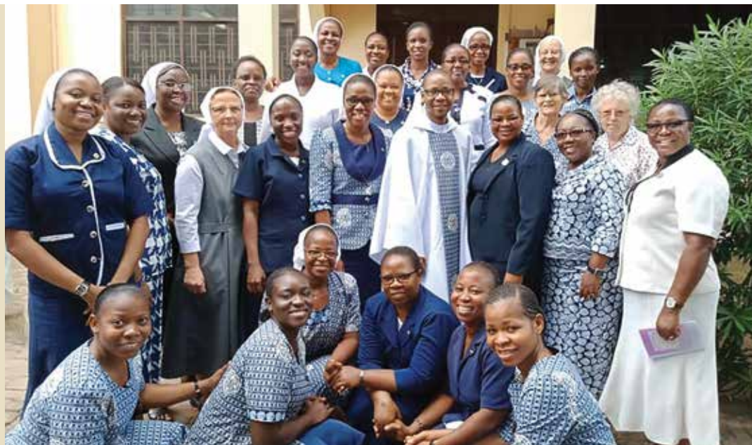
The Province of Africa celebrates the installation of the third Provincial Council, August 28, 2019 (the Feast of St. Augustine) in Accra, Ghana.

In many parts of Sub-Saharan Africa, women like to dress alike for special occasions. In these pictures you can see the cloth that was created especially for the beginning of the new Province of Africa. It contains our own SSND symbol and has a border with a Ghanaian symbol for God.