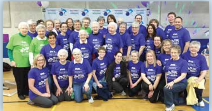
Sisters and lay staff at Our Lady of Good Counsel in Mankato, Minn., participate in the 8th Annual Pedal Past Poverty for Partners for Affordable Housing on Saturday, February 22, 2020. The group took the prize for the most money earned, which was $26,024.00.