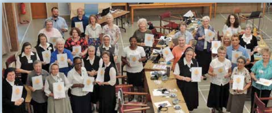
International members of the Congregational Communications and Technology Team (CCTT) meeting in Rome in August 2019 to finalize a new communications plan for the congregation.