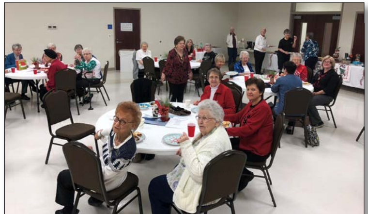
Associates from Chatawa, Mississippi, gathered with Sisters at Holy Trinity Parish Hall in Covington, Louisiana, for a Christmas party.