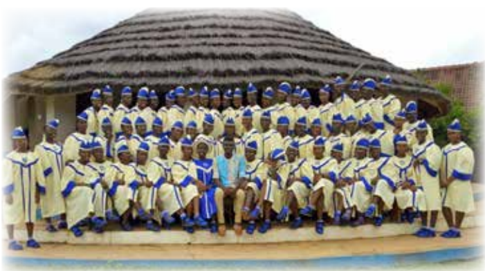
The Angelic Voices Choir of Notre Dame Secondary School, Mkar

of our God given gifts from these girls at Mkar. They believe that they are doing God's work with their own gift, what about you?