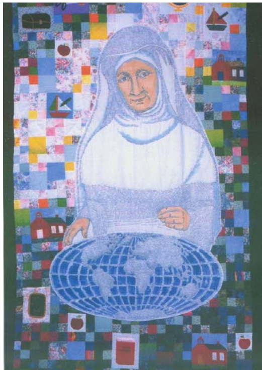
St. Louis, Missouri

By her beatification on November 17, 1985, the Church proclaimed to the entire world that Mother Theresa, a woman led by the Lord, can be a model for all on their way to God. In one of her letters Mother Theresa speaks with characteristic directness, summarizing, in a way, her own faith-journey, and praying for us as we continue on ours: "May God be our goal and end in all things, our highest good, in whom we find everything that gives us peace and makes us truly happy." 18