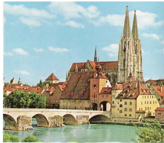
Regensburg Cathedral & stone bridge