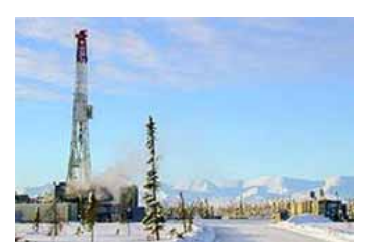
Phillips shale oil A Conoco fracking site in Canada's Northwest Territories

Hydraulic fracturing is about to move into the Canadian Arctic, with companies exploring the region's rich shale oil deposits. But many indigenous people and conservationists have serious concerns about the impact of fracking on its people and wild life in more fragile northern environments. Canadian energy developments, according to many scientists and local residents, are proceeding rapidly without consideration for how emissions from these new fuel sources will affect the global climate.