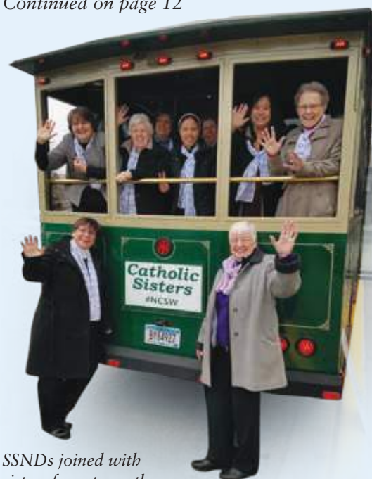
SSNDs joined with sisters from two other religious communities in St. Paul, Minnesota, for a trolley tour around the Twin Cities to bring awareness to religious life in the community.