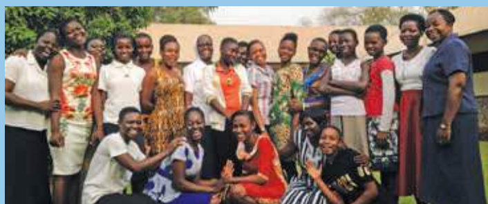
Interested women from various areas of Ghana gathered with SSNDs for a seminar to learn about the congregation, discernment, identifying individual gifts and talents, service, prayer, and the different vocational calls.

“They admire and are interested in SSND life because of their experiences with us, including our effort to witness to unity in