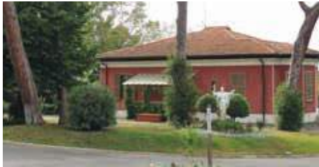
La Casetta, on the Generalate property in Rome, is home to a young family from the Democratic Republic of the Congo.

the home to the leaders of an ecclesial lay movement. For about a year it had been empty, and during that time, the SSND General Council looked into the best way to offer the house for use by refugees seeking to build a safer life in Italy.